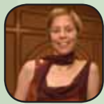
Augusta Read Thomas - New York The A.R.T. of Composing