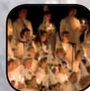
Uppsala Cathedral Girls and Boys Choir Sweeder.