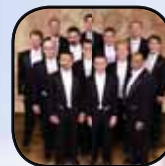
Chanticleer - California