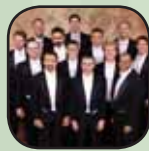
Chanticleer - California The Artistry and Inspiration of Chanticleer